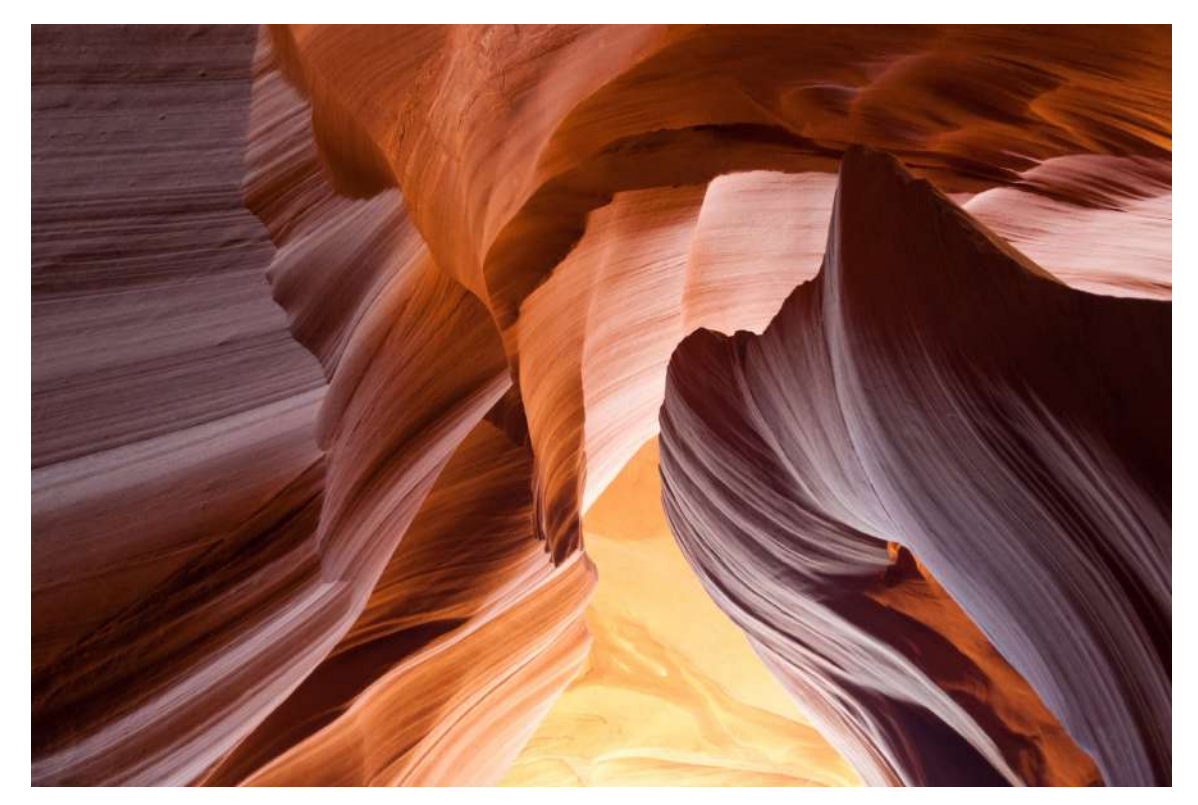
CALLED TO SHARE CHRIST'S LOVE WITH ALL.

"The Spirit of Our Lord's News" Our Lord's Lutheran Church 150 Wilma Drive Maryville, IL 62062 (618) 345-5692 (Office Bldg.) www.OURLORDS.org