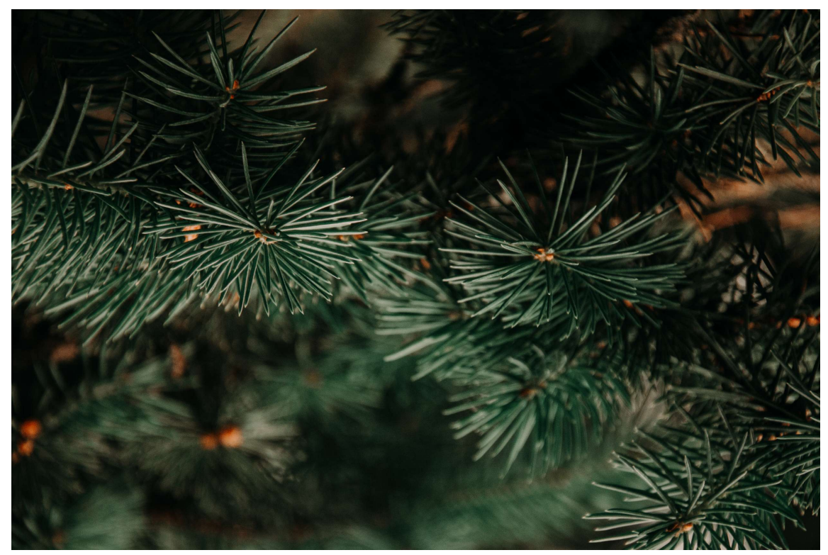
"Called to shave Christ's love with all."

"The Spirit of Our Lord's News" Our Lord's Lutheran Church 150 Wilma Drive Maryville, IL 62062 (618) 345-5692 (Office Bldg.) www.OURLORDS.org