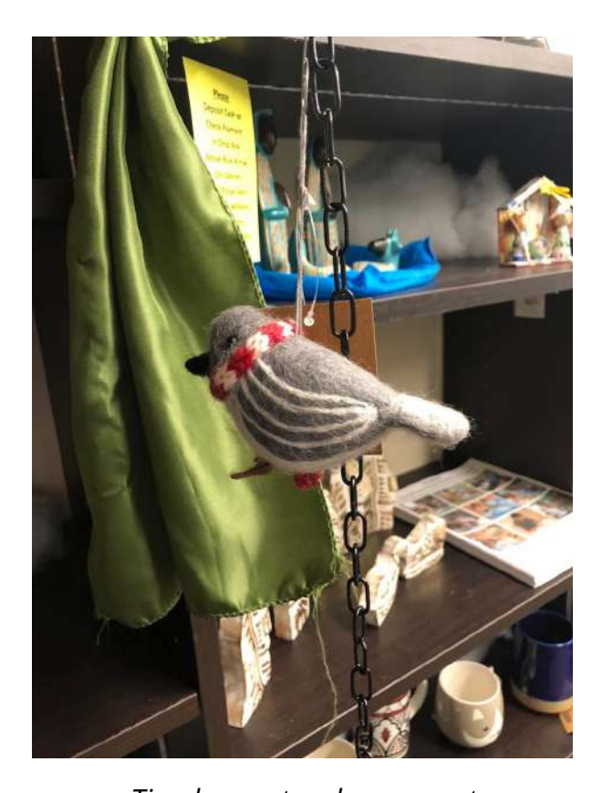
Timeless natural ornaments