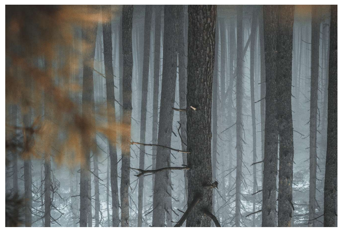
"Called le share Christ's love with all.

"The Spirit of Our Lord's News" Our Lord's Lutheran Church 150 Wilma Drive Maryville, IL 62062 (618) 345-5692 (Office Bldg.) www.OURLORDS.org