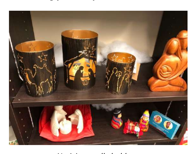
Nativity candle holders

You're hungry or thirsty - coffee, tea, chocolate, nuts.