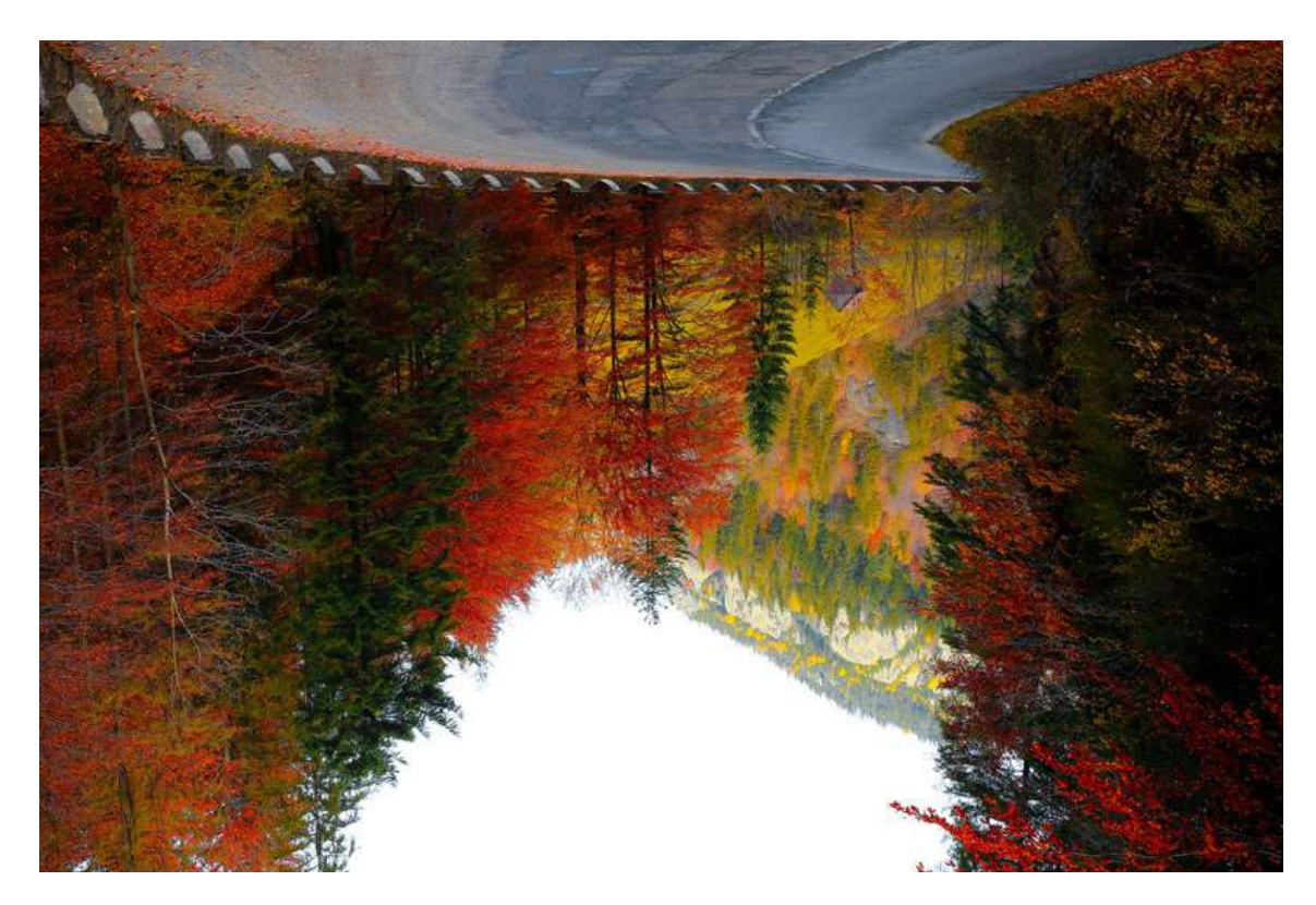
"CALLED TO SHARE CHRIST'S LOVE WITH ALL."

"The Spirit of Our Lord's News" Our Lord's Lutheran Church 150 Wilma Drive Maryville, IL 62062 (618) 345-5692 (Office Bldg.) www.OURLORDS.org