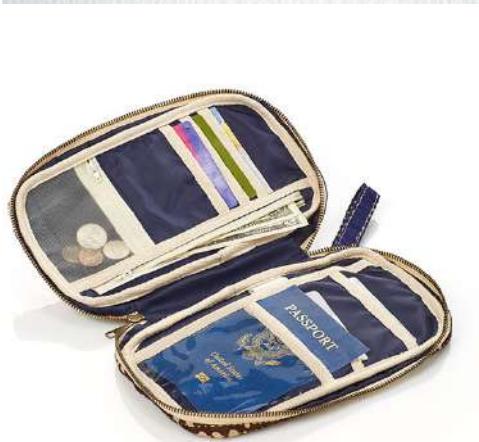
Kantha Travel Organizer