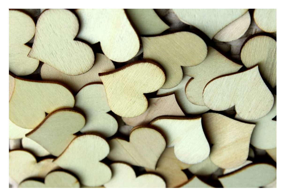
"Called to share Christ's love with all"

"The Spirit of Our Lord's News" Our Lord's Lutheran Church 150 Wilma Drive Maryville, IL 62062 (618) 345-5692 (Office Bldg.) www.OURLORDS.org