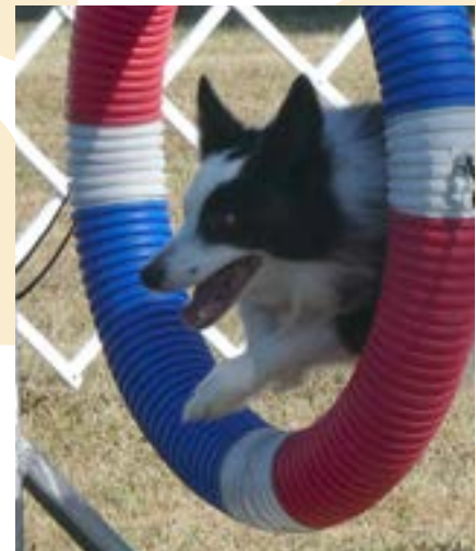
from the 2022 Pet Expo.